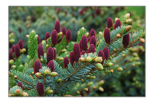
Red Cone Spruce fruit

Red Cone Spruce is recommended for the following landscape applications;