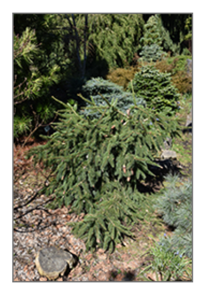
Red Cone Spruce