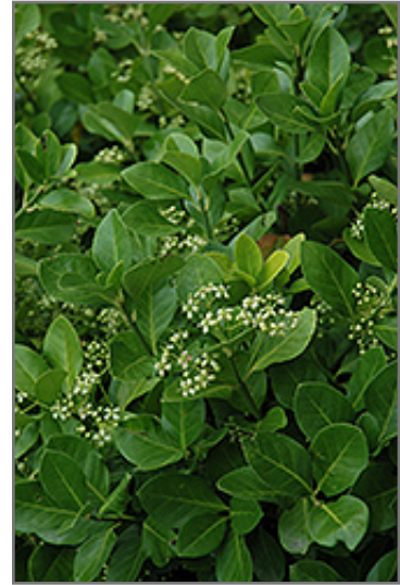
Manhattan Spreading Euonymus flowers

This shrub performs well in both full sun and full shade. It is very adaptable to both dry and moist locations, and should do just fine under average home landscape conditions. It is not particular as to soil type or pH. It is highly tolerant of urban pollution and will even thrive in inner city environments, and will benefit from being planted in a relatively sheltered location. This is a selected variety of a species not originally from North America.