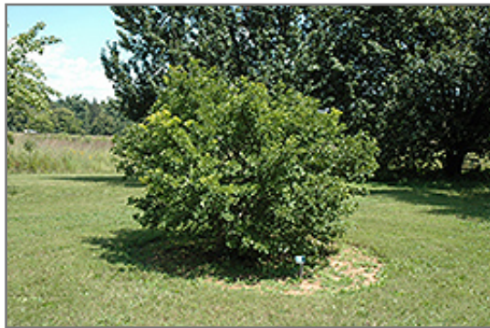
Jade Butterflies Ginkgo