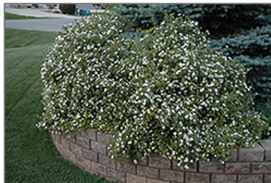
Abbotswood Potentilla in bloom