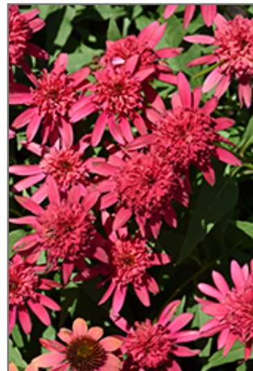
Double Scoop Raspberry Coneflower flowers