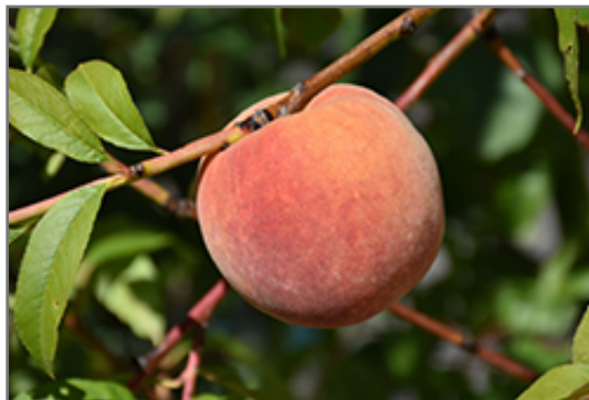
Redhaven Peach fruit

Redhaven Peach is covered in stunning clusters of fragrant pink flowers along the branches in early spring, which emerge from distinctive rose flower buds before the leaves. It has dark green deciduous foliage. The narrow leaves turn yellow in fall. The fruits are showy yellow drupes with a red blush, which are carried in abundance in mid summer. The fruit can be messy if allowed to drop on the lawn or walkways, and may require occasional clean-up.