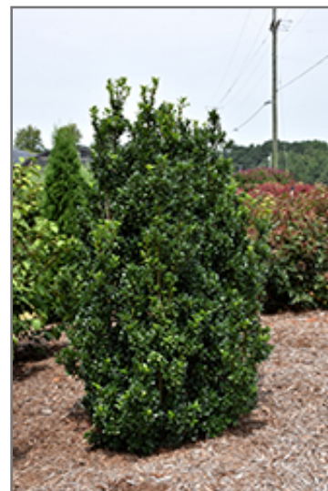
Castle Wall Meserve Holly