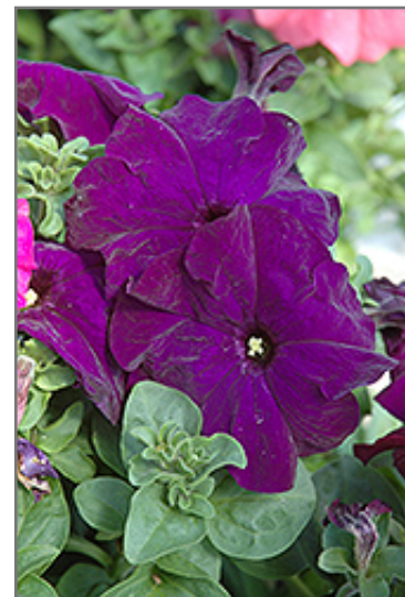
Dreams Midnight Petunia flowers