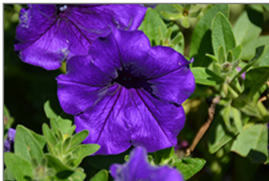
Easy Wave Blue Petunia flowers