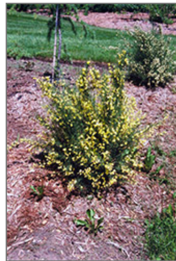
Scotch Broom in bloom