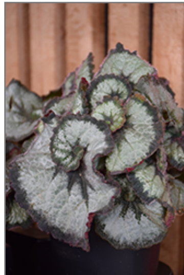
Escargot Begonia foliage