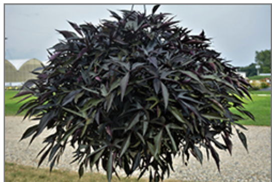
Illusion Midnight Lace Sweet Potato Vine