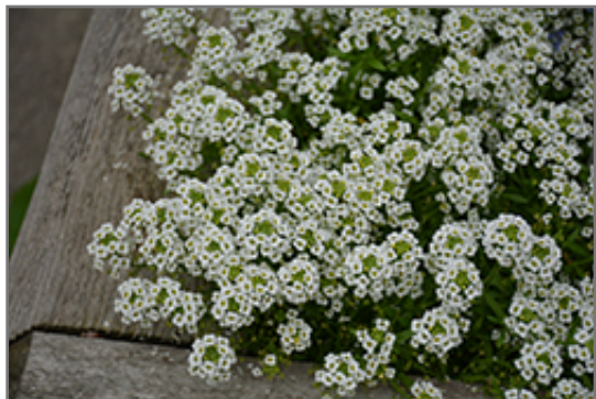
Snow Princess Alyssum flowers

Snow Princess Alyssum is recommended for the following landscape applications;