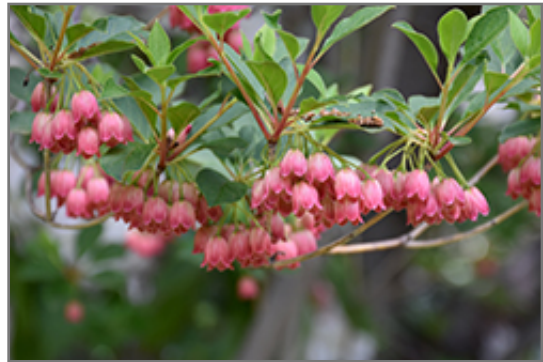
Redvein Enkianthus flowers