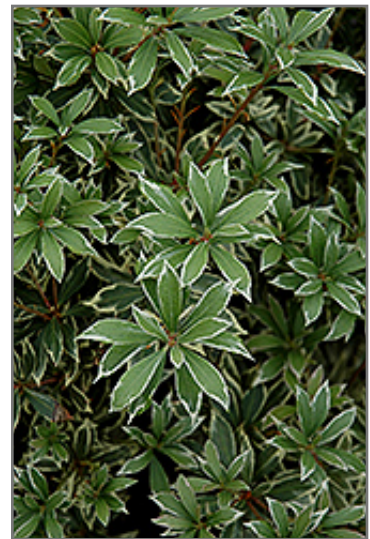
Little Heath Japanese Pieris foliage