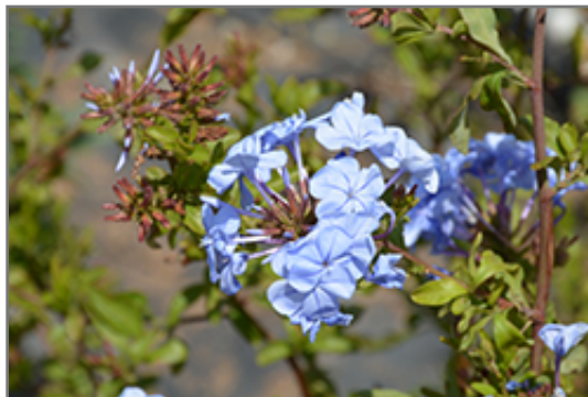
Imperial Blue Plumbago flowers

Imperial Blue Plumbago is recommended for the following landscape applications;