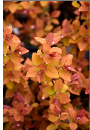
Double Play Big Bang Spirea foliage

This shrub should only be grown in full sunlight. It prefers to grow in average to moist conditions, and shouldn't be allowed to dry out. It is not particular as to soil type or pH. It is highly tolerant of urban pollution and will even thrive in inner city environments. This particular variety is an interspecific hybrid.