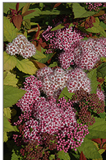
Double Play Big Bang Spirea flowers

Double Play Big Bang Spirea is recommended for the following landscape applications;