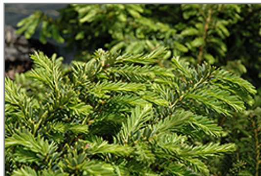
Emerald Spreader Yew foliage