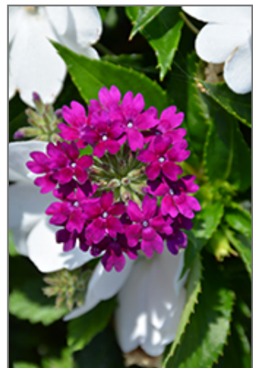
Superbena Royale Plum Wine Verbena flowers