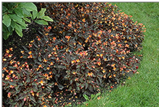
Sparks Will Fly Begonia in bloom