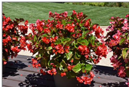
Whopper Red Green Leaf Begonia flowers