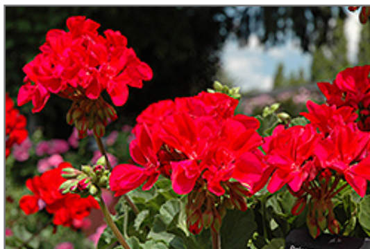
Fantasia Cranberry Sizzle Geranium flowers