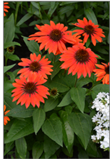
Sombrero Flamenco Orange Coneflower in bloom

Sombrero Flamenco Orange Coneflower is recommended for the following landscape applications;