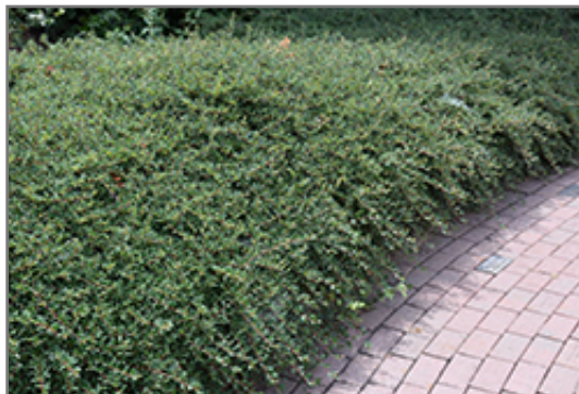
Coral Beauty Cotoneaster