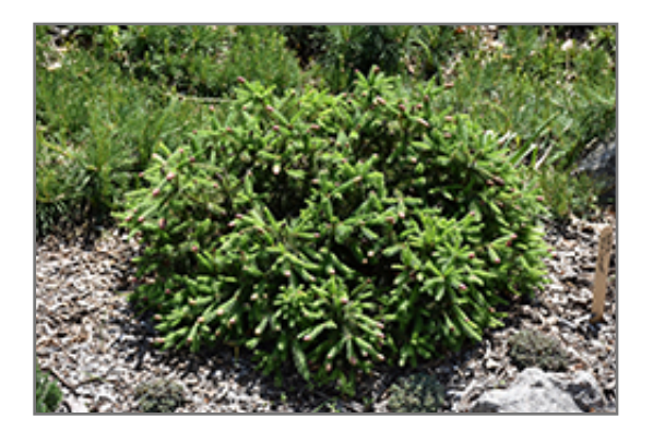
Pusch Spruce