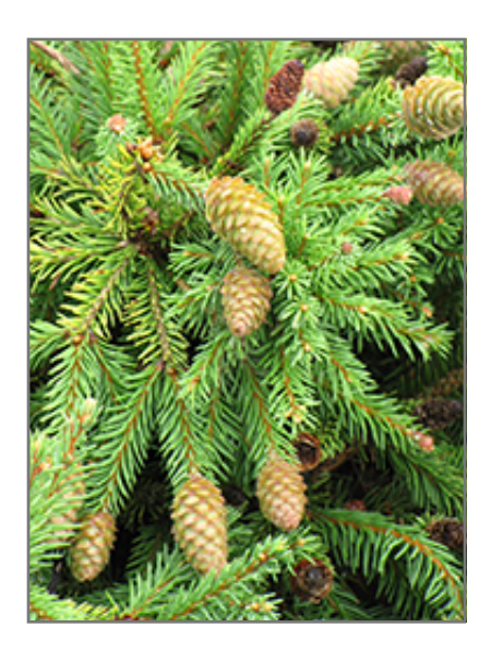
Pusch Spruce foliage