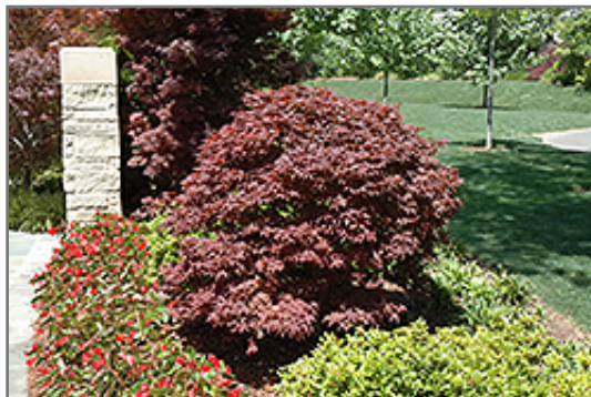
Rhode Island Red Japanese Maple