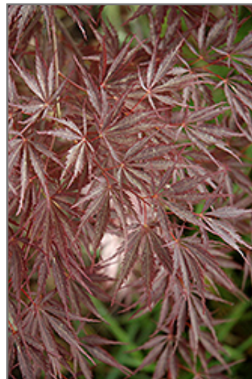
Sherwood Elfin Japanese Maple foliage

Sherwood Elfin Japanese Maple is recommended for the following landscape applications;