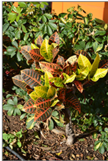
Variegated Croton