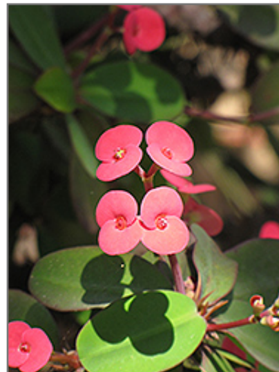
Crown Of Thorns flowers

Crown Of Thorns is recommended for the following landscape applications;