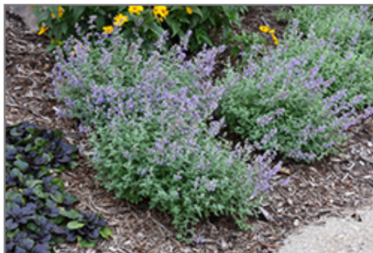
Purrsian Blue Catmint in bloom