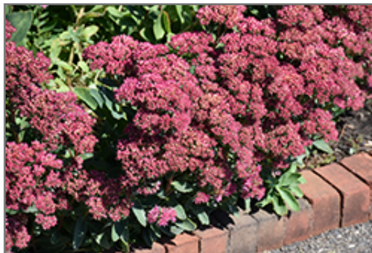
Carl Stonecrop in bloom

This is a relatively low maintenance plant, and is best cleaned up in early spring before it resumes active growth for the season. It is a good choice for attracting bees and butterflies to your yard, but is not particularly attractive to deer who tend to leave it alone in favor of tastier treats. It has no significant negative characteristics.