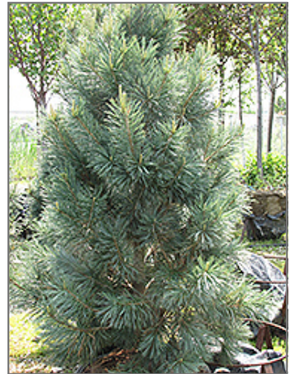
Vanderwolf's Pyramid Pine