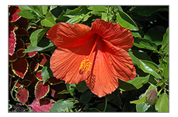
Empire Hibiscus flowers

This plant is native to the tropics and prefers growing in moist environments with evenly warm conditions all year round. In our climate, it is usually grown as an outdoor annual in the garden or in a container. If you want it to survive the winter, it can be brought in to the house and provided with special care, and then returned to the garden the following season. In its preferred tropical habitat, it can grow to be around 8 feet tall at maturity, with a spread of 6 feet. However, when grown as an annual or when overwintered indoors, it can be expected to perform differently, and its exact height and spread will depend on many factors; you may wish to consult with our experts as to how it might perform in your specific application and growing conditions.