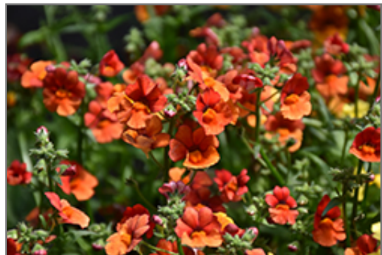
Sunsatia Blood Orange Nemesia flowers