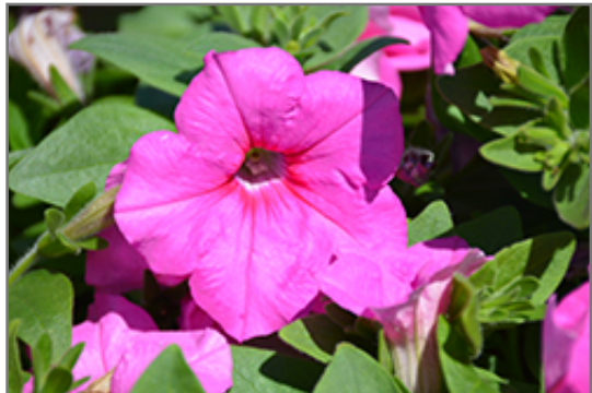
Easy Wave Pink Passion Petunia flowers

Easy Wave Pink Passion Petunia is recommended for the following landscape applications;