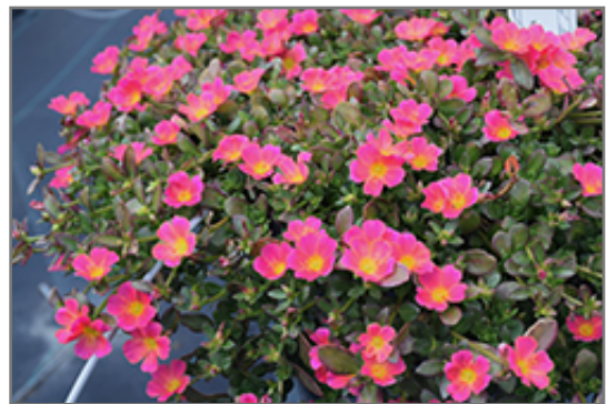
Mojave Pink Portulaca flowers