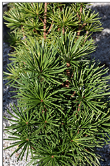
Green Star Umbrella Pine foliage