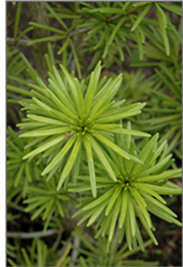
Green Star Umbrella Pine foliage

Green Star Umbrella Pine makes a fine choice for the outdoor landscape, but it is also well-suited for use in outdoor pots and containers. Its large size and upright habit of growth lend it for use as a solitary accent, or in a composition surrounded by smaller plants around the base and those that spill over the edges. It is even sizeable enough that it can be grown alone in a suitable container. Note that when grown in a container, it may not perform exactly as indicated on the tag - this is to be expected. Also note that when growing plants in outdoor containers and baskets, they may require more frequent waterings than they would in the yard or garden.