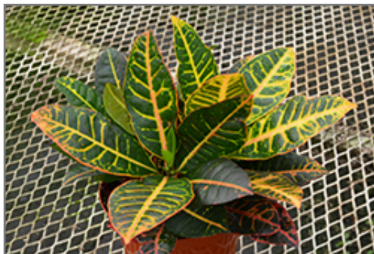
Petra Variegated Croton in full