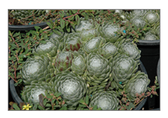
Forest Frost Cobweb Hens And Chicks

This is a dense herbaceous houseplant with tall flower stalks held atop a low mound of foliage. Its extremely fine and delicate texture is quite ornamental and should be used to full effect. This plant should not require much pruning, except when necessary to keep it looking its best.