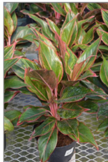
Siam Aurora Chinese Evergreen in full