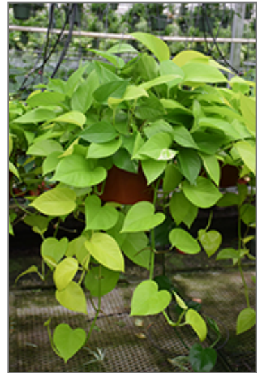
Neon Pothos in full

When grown indoors, Neon Pothos can be expected to grow to be about 5 feet tall at maturity, with a spread of 24 inches. It grows at a fast rate, and under ideal conditions can be expected to live for approximately 10 years. This houseplant performs well in both bright or indirect sunlight and strong artificial light, and can therefore be situated in almost any well-lit room or location. It does best in average to evenly moist soil, but will not tolerate standing water. The surface of the soil shouldn't be allowed to dry out completely, and so you should expect to water this plant once and possibly even twice each week. Be aware that your particular watering schedule may vary depending on its location in the room, the pot size, plant size and other conditions; if in doubt, ask one of our experts in the store for advice. It is not particular as to soil type or pH; an average potting soil should work just fine. Be warned that parts of this plant are known to be toxic to humans and animals, so special care should be exercised if growing it around children and pets.