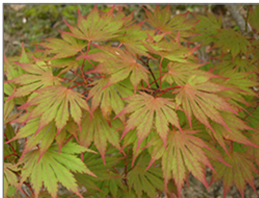
Sensu Full Moon Maple foliage