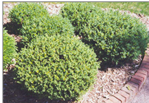
Japanese Boxwood