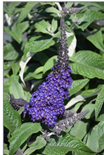
Pugster Blue Butterfly Bush flowers

Pugster Blue Butterfly Bush is recommended for the following landscape applications;