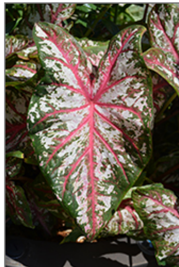
Artful Fire and Ice Caladium foliage