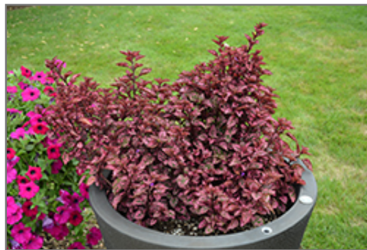
Hippo Rose Polka Dot Plant