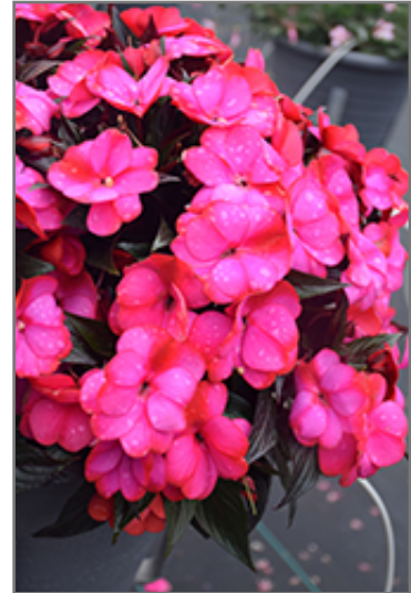
Infinity Blushing Lilac New Guinea Impatiens flowers

Infinity Blushing Lilac New Guinea Impatiens is recommended for the following landscape applications;