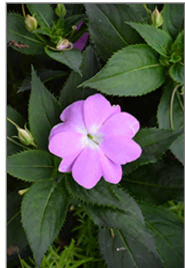
SunPatiens Compact Orchid New Guinea Impatiens flowers

This plant will require occasional maintenance and upkeep, and should not require much pruning, except when necessary, such as to remove dieback. It has no significant negative characteristics.