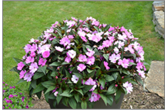
SunPatiens Compact Orchid New Guinea Impatiens in bloom

SunPatiens Compact Orchid New Guinea Impatiens is a fine choice for the garden, but it is also a good selection for planting in outdoor containers and hanging baskets. It can be used either as 'filler' or as a 'thriller' in the 'spiller-thriller-filler' container combination, depending on the height and form of the other plants used in the container planting. It is even sizeable enough that it can be grown alone in a suitable container. Note that when growing plants in outdoor containers and baskets, they may require more frequent waterings than they would in the yard or garden.