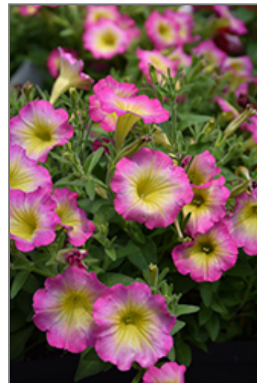
Supertunia Daybreak Charm Petunia flowers

Supertunia Daybreak Charm Petunia is a dense herbaceous annual with a trailing habit of growth, eventually spilling over the edges of hanging baskets and containers. Its medium texture blends into the garden, but can always be balanced by a couple of finer or coarser plants for an effective composition.