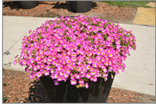
Supertunia Daybreak Charm Petunia in bloom