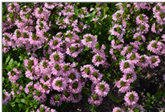
Whirlwind Pink Fan Flower flowers